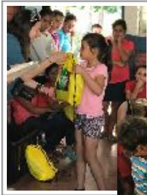
Jolie handing out a gift bag at a village school